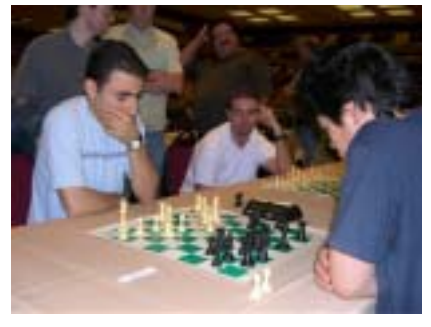
IM Akobian vs. GM Nakamura