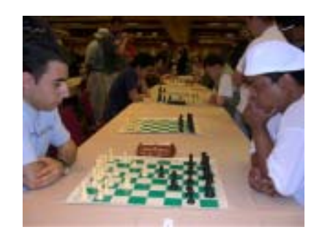
IM Akobian vs. Sevillano